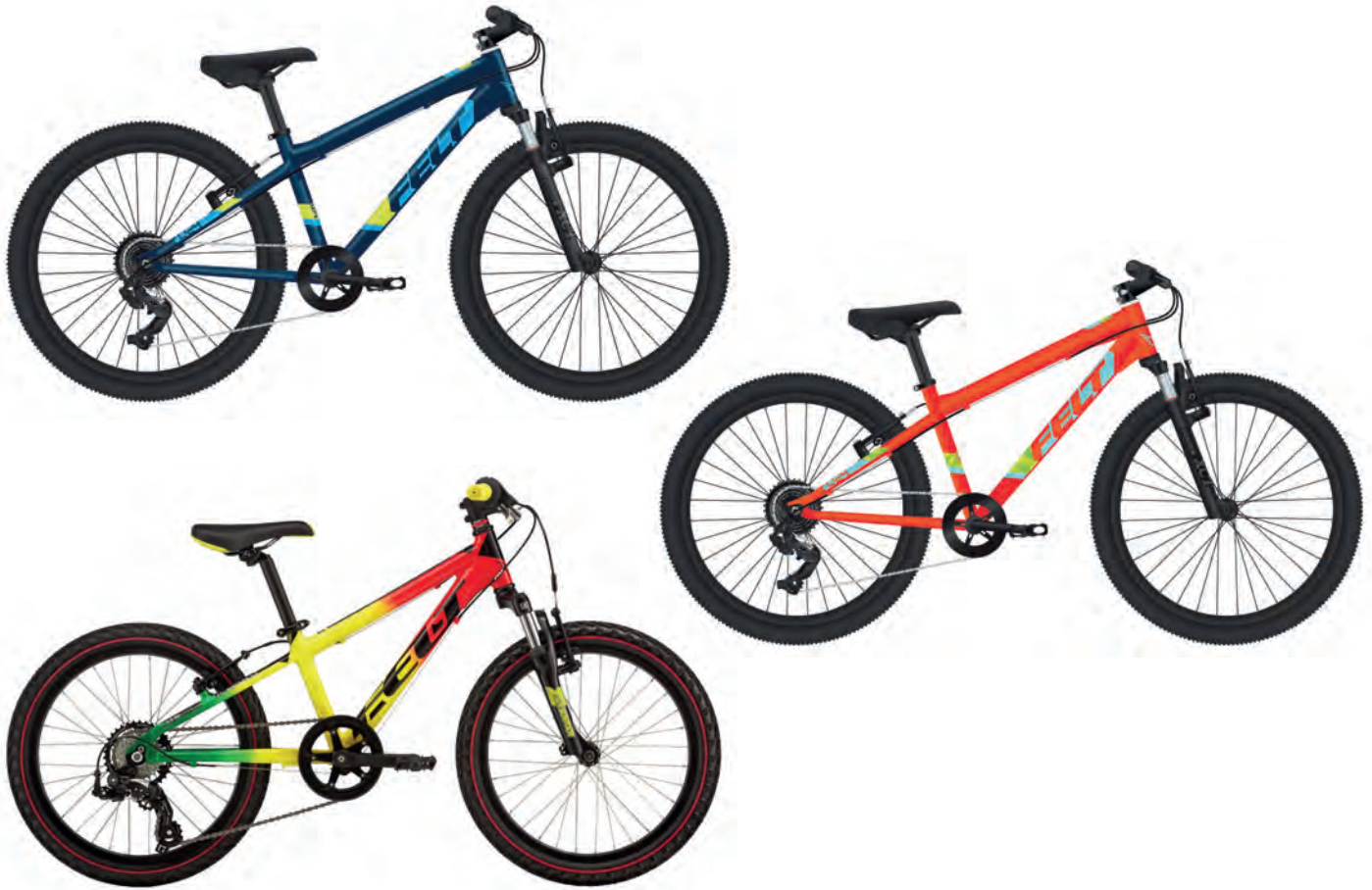
FINISH 1. Gloss Blue (Cyan/Chartreuse)